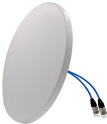
Front Isometric View